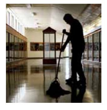
Pests in Schools Advice on how to keep your school pests in detention